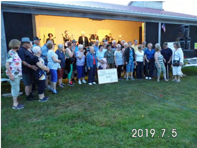
PHOTO OF STAGE & SEATING AREA.

The 35th annual festival will be held at the beautiful Dundas Fair Grounds in Dundas, PEI for the second year. The grounds are a very level, spacious and convenient venue for a festival. Lots of camping space and a large indoor airconditioned space in case of bad weather.